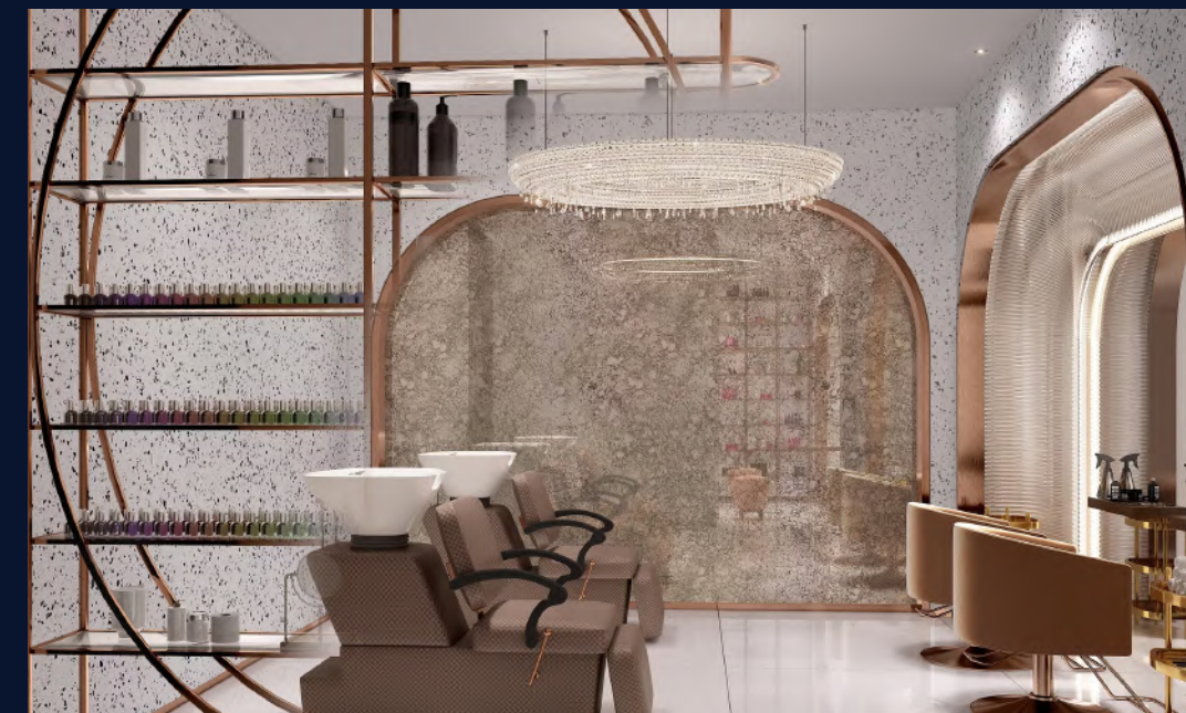
SPA AND SALON