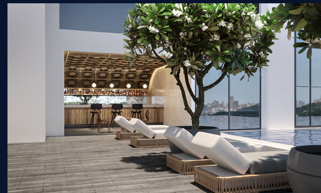
POOL WITH CAFE