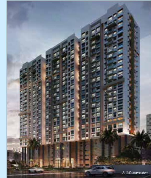
Hubtown Premiere Residences, Andheri West