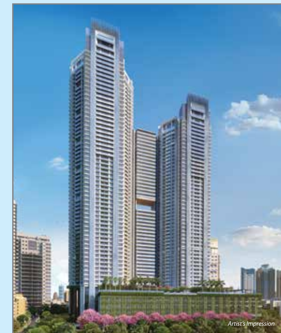
25 South, Prabhadevi