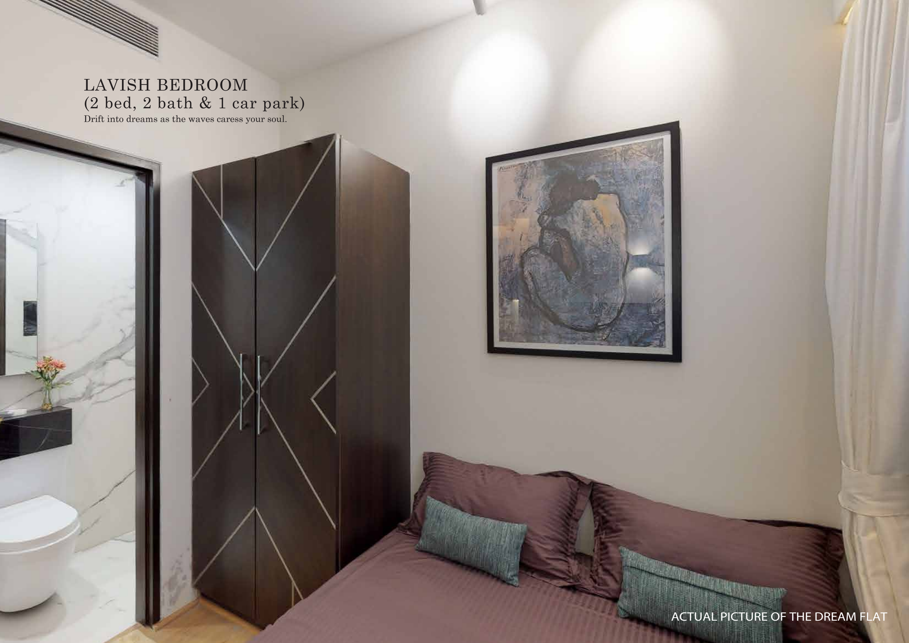
ACTUAL PICTURE OF THE DREAM FLAT