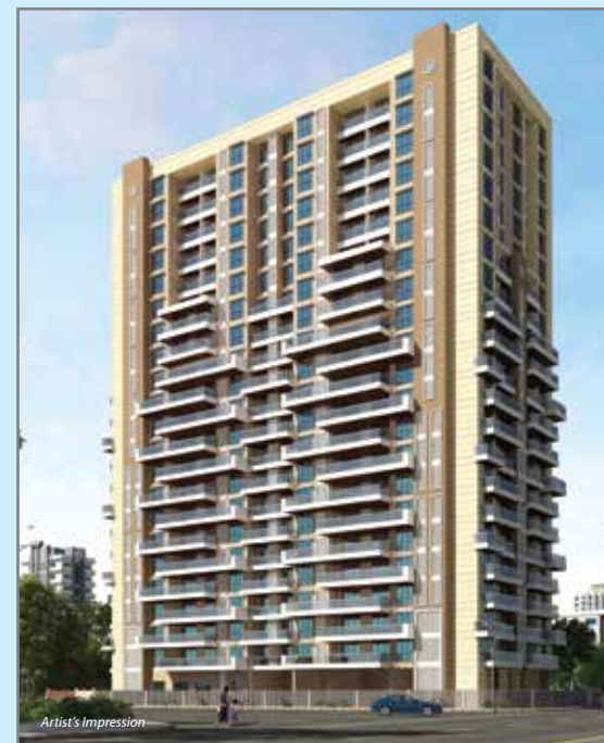
Hubtown Sunstone, Bandra Annexe