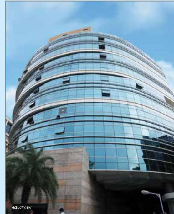
Hubtown Solaris, Andheri East